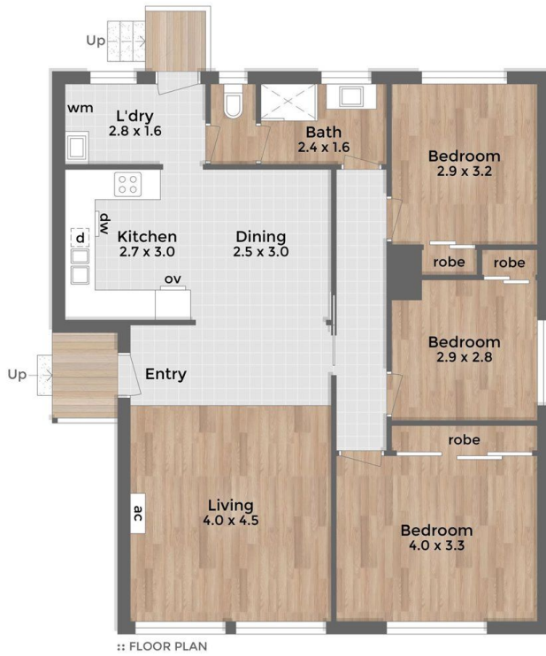
:: FLOOR PLAN